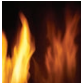
MIRRO-FLAME™ porcelain reflective radiant panels