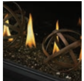
Wrought iron globes