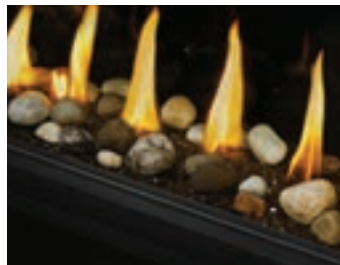
Mineral rock kit