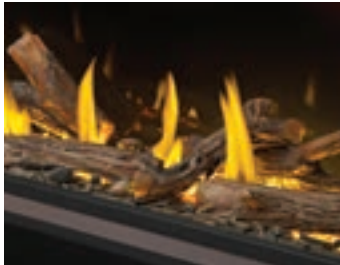
High-definition oak logs

Recommended: Combination of logs with glass beads, embers or optional enhancement kit or glass, or media/glass on its own