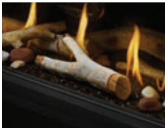
Birch log kit