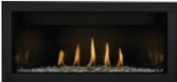
Ascent™ Linear Premium