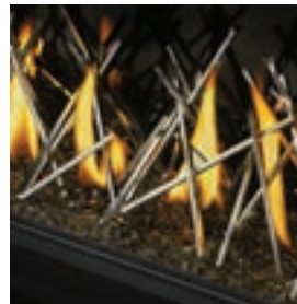
Nickel stix designer fire art