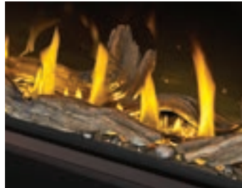
High-definition driftwood logs