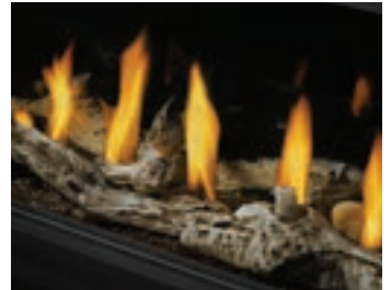
Beach fire kit