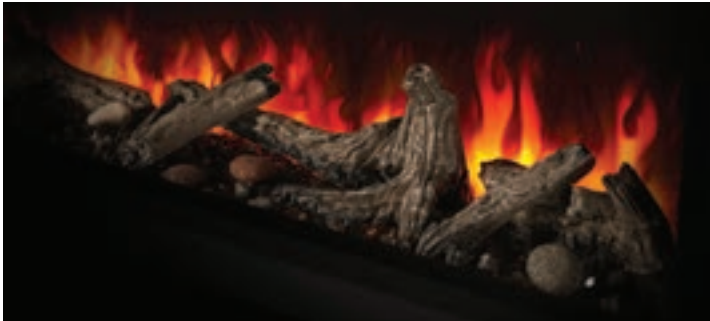
Driftwood logs with woodland kit