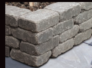
Optional Brick Kit