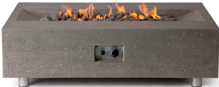
Slate Grey shown above with Optional Aluminum Legs MI-SL-NG/LP