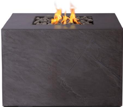
Charcoal Grey shown above CA-CH-NG/LP

Caballo is inspired by mid century modern design and includes authentic Bali beach rock for a sophisticated style.