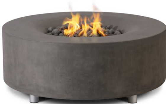
Slate Grey shown above with Optional Aluminum Legs AV-SL-NG/LP