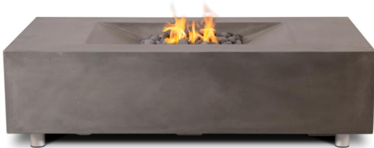
Slate Grey shown with Optional 3" Aluminum Legs above MO-SL-NG/LP