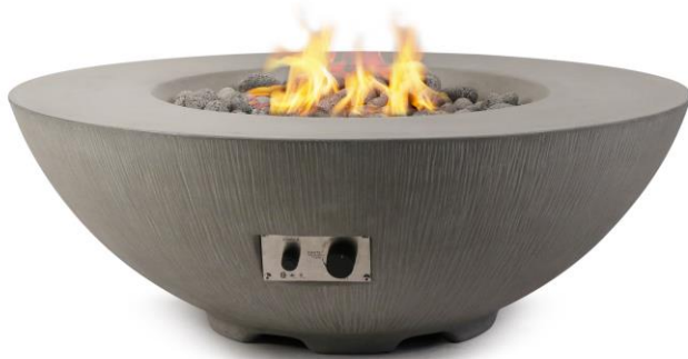
Slate grey shown above with Optional Aluminum Legs SH-SL-NG/LP