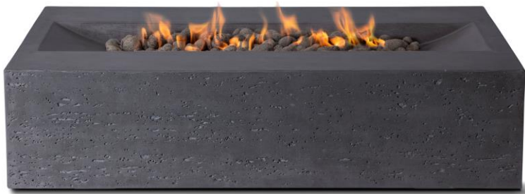
Charcoal Grey shown above MI-CH-NG/LP

Millenia is inspired by mid century modern design and includes authentic Bali beach rock for a sophisticated style.