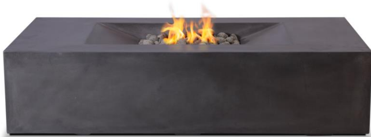
Charcoal Grey shown above MO-CH-NG/LP