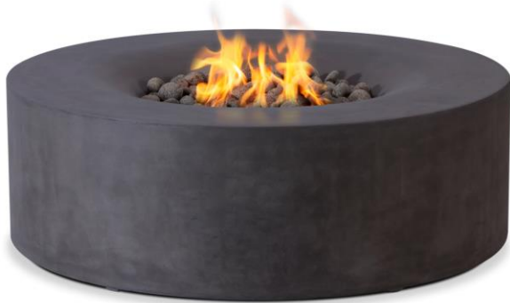
Charcoal Grey shown above AV-CH-NG/LP