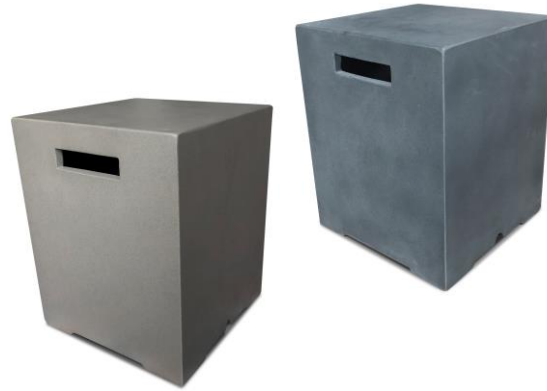
Hurmit Square Tank Covers