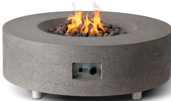
Slate Grey shown above with Optional Aluminum Legs GE-SL-NG/LP