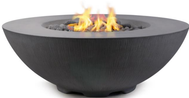
Charcoal Grey shown above SH-CH-NG/LP

Shangri-la is inspired by mid century modern design and includes authentic Bali beach rock for a sophisticated style.