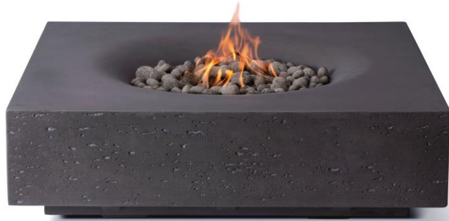
Charcoal Grey shown above IN-CH-NG/LP

Infinity is inspired by mid century modern design and includes authentic Bali beach rock for a sophisticated style.