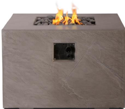
Slate Grey shown above CA-SL-NG/LP