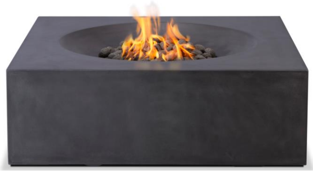
Charcoal Grey shown above TA-CH-NG/LP