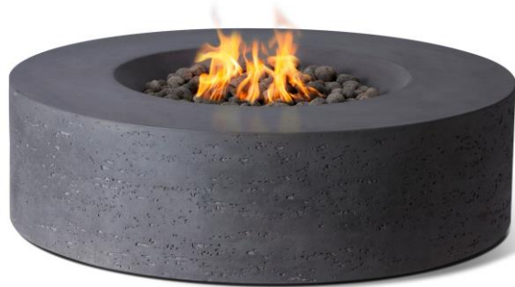
Charcoal Grey shown above GE-CH-NG/LP

Genesis is inspired by mid century modern design and includes authentic Bali beach rock for a sophisticated style.