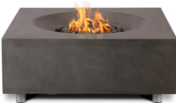
Slate Grey shown above with Optional Aluminum Legs TA-SL-NG/LP