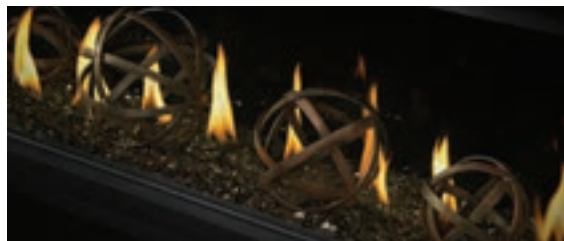
Wrought iron globes