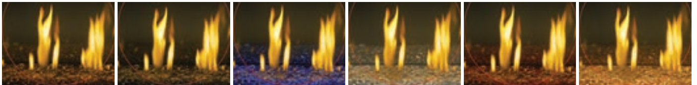
Glass beads: amber, black, blue, clear, red, topaz