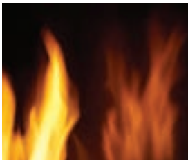
MIRRO-FLAME porcelain reflective radiant panels