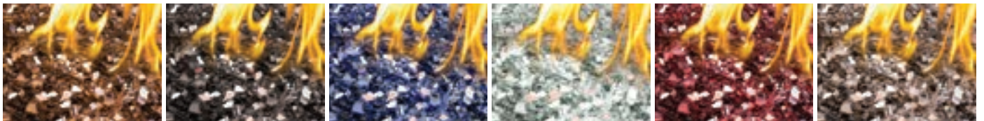
Glass embers: amber, black, blue, clear, red, topaz