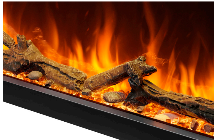
Included: Beach Fire Log set and Woodland media kit