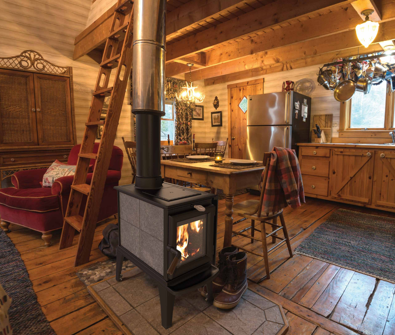
The Lincoln 8060 Wood Burning Stove