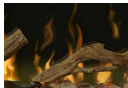
Driftwood and River Rock Ember Bed Kit