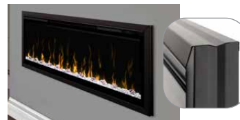
Ignite XL Trim Kit