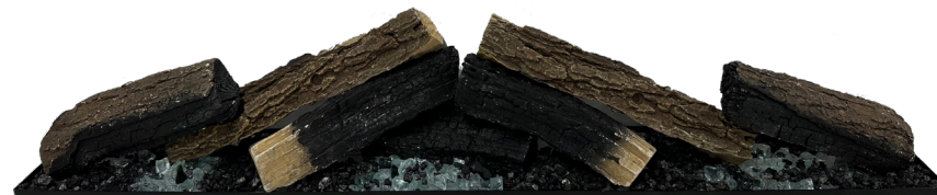
E-FX SL 750