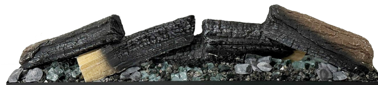
E-FX SL 600