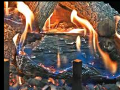
Shown: 24" Burner with Weathered Oak Charred Log Set