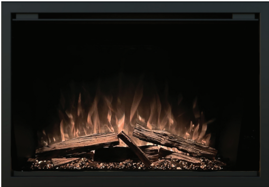
Condensed layout example for Redstone and Orion Traditional Units