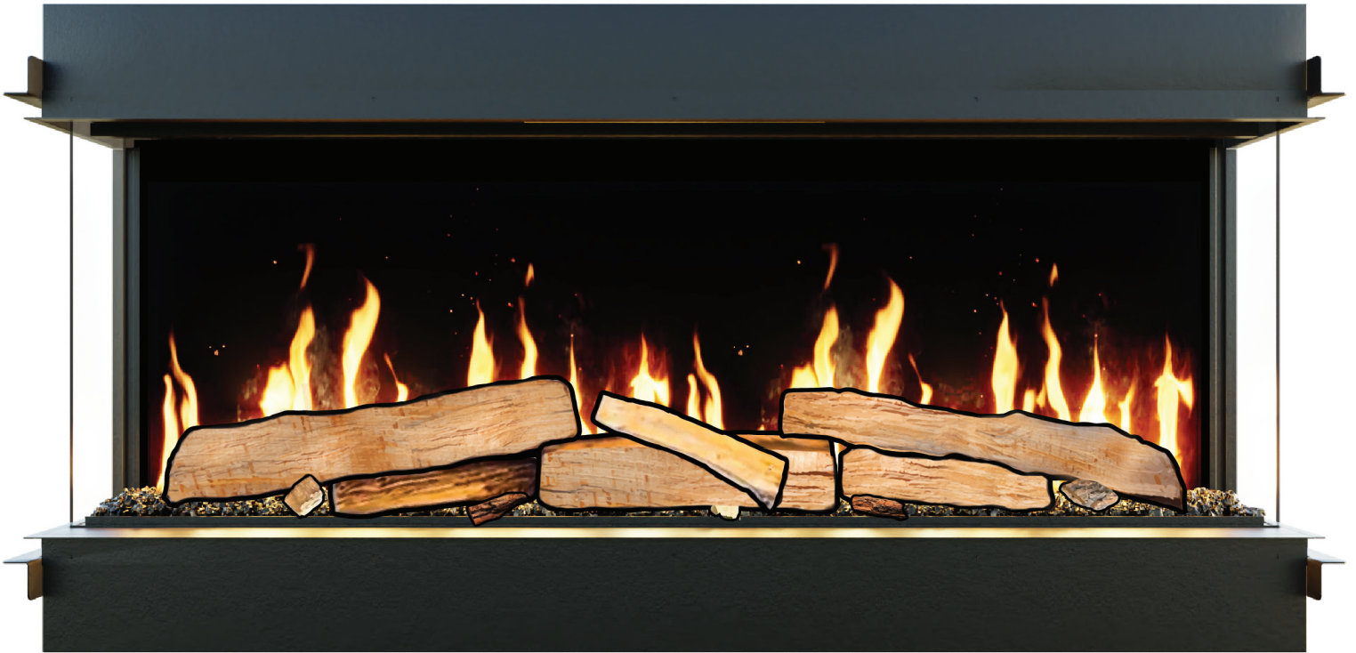
42"-44", TruWood Premium Timber Kit, large installation is complete.