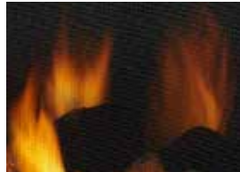
Reflective Black Glass