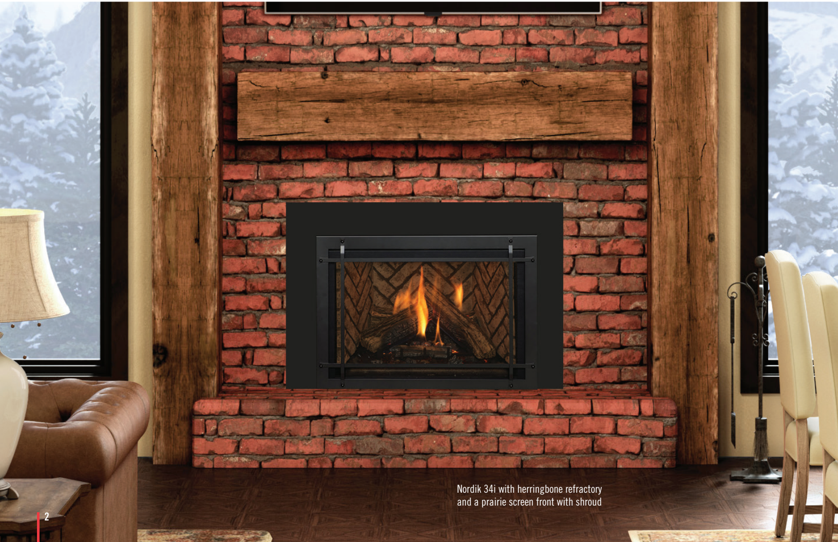
Nordik 34i with herringbone refractory and a prairie screen front with shroud