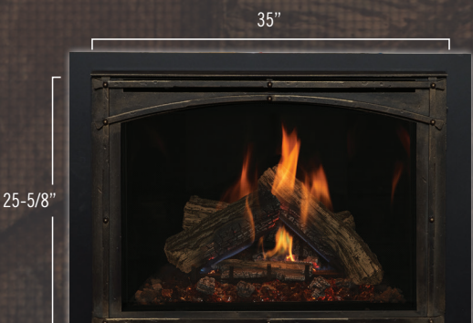
Arched Mission Screen Front in Vintage Bronze with Black Glass Panels Available in Vintage Bronze