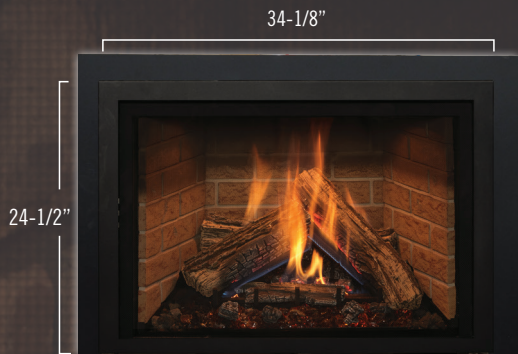
Rectangle Screen Front With Rustic Brick refractory Available in Black, Antique Copper, Brushed Nickel