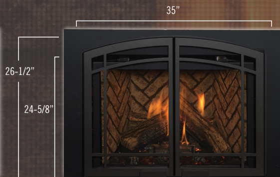
Arched Prairie Full Door with Herringbone Refractory Available in Black