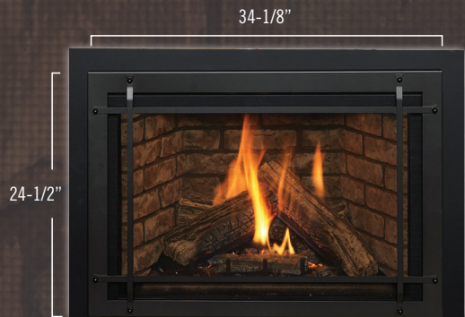
Prairie Screen Front with Chicago Brick refractory Available in Black