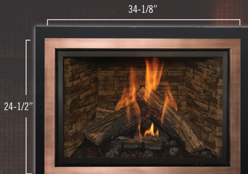
Antique Copper Rectangle Screen Front With Ledgestone refractory Available in Black, Antique Copper, Brushed Nickel