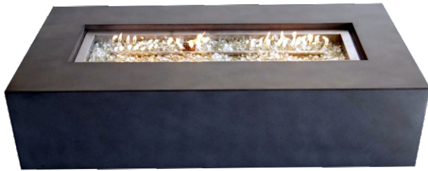
GI-FP416BK Rectangle Firepit Size: 51.96" L x 25.98" W x 12.99" H