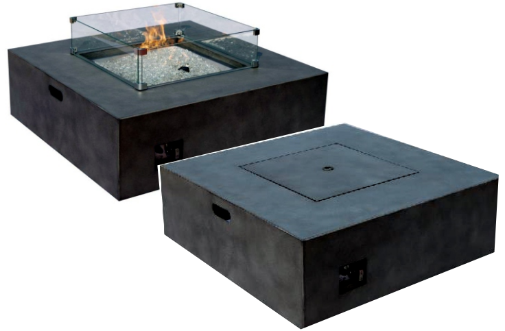
GI-FP419 Square Firepit shown with optional wind guard Size: 37.99" L x 37.99" W x 12.99" H