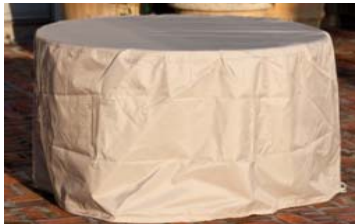
Water-Resistant Cover included