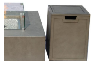
Optional - Tank Holder