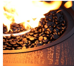
Black Firebeads included