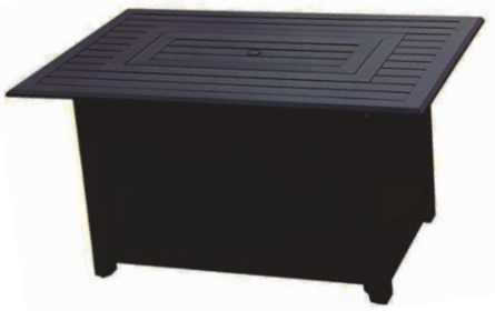
GI-FP341BK Rectangle Firepit Size: 46" L x 31" W x 24.5" H