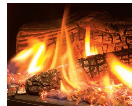
High definition log set