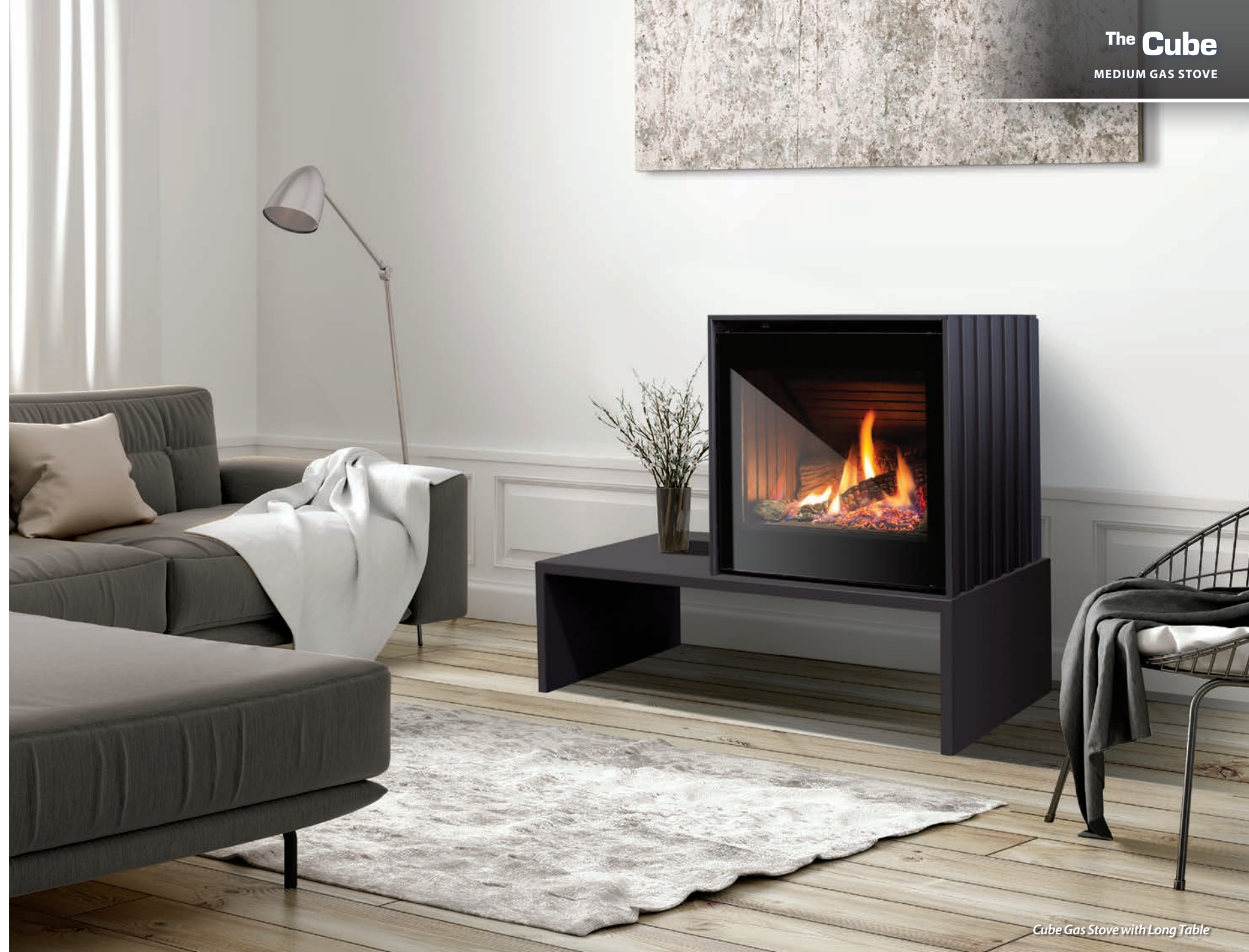
Cube Gas Stove with Long Table