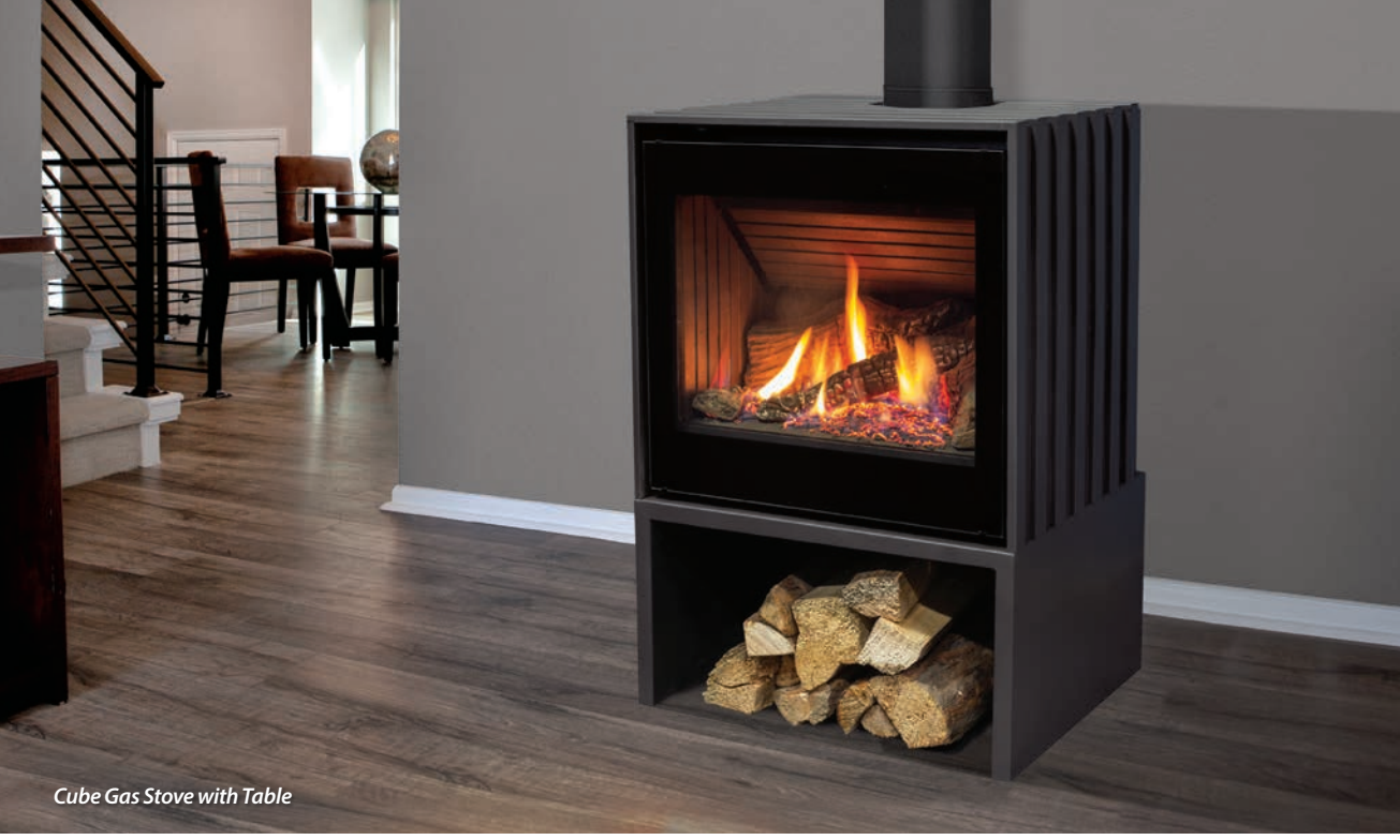
Cube Gas Stove with Table