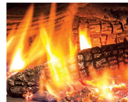
High definition log set