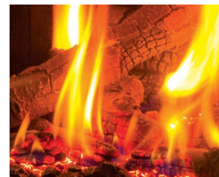
9 Piece ultra high definition log set