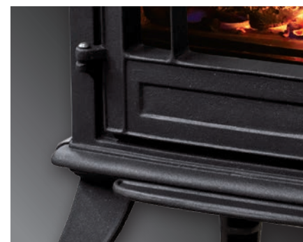
Cast iron doors