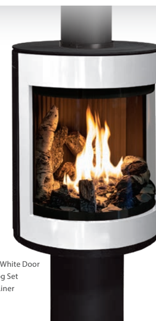
Carrara White Door Birch Log Set Fluted Liner