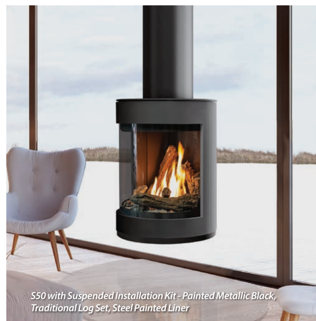
S50 with Suspended Installation Kit - Painted Metallic Black, Traditional Log Set, Steel Painted Liner