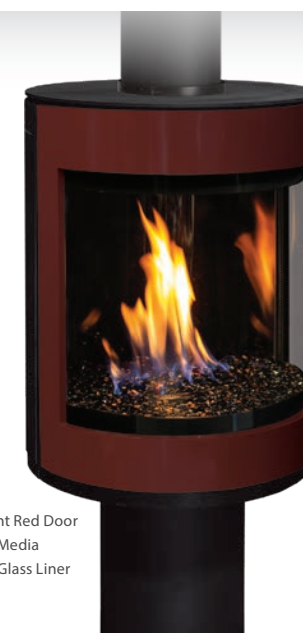
Radiant Red Door Glass Media Black Glass Liner