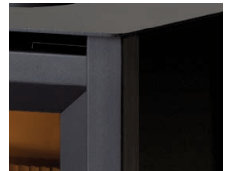
Modern steel construction