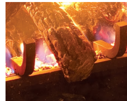
Steel fireplace grate