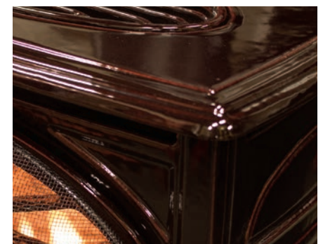
Enameled antique chestnut finish