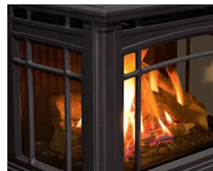
Flame visible from three sides

* Turn down is based on IPI valve with front burner being turned off. (SIT Proflame 2 models only)