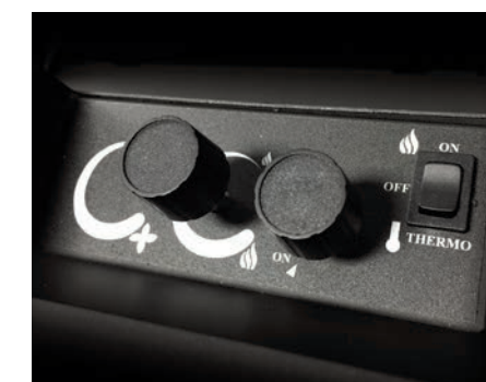
Easy access controls