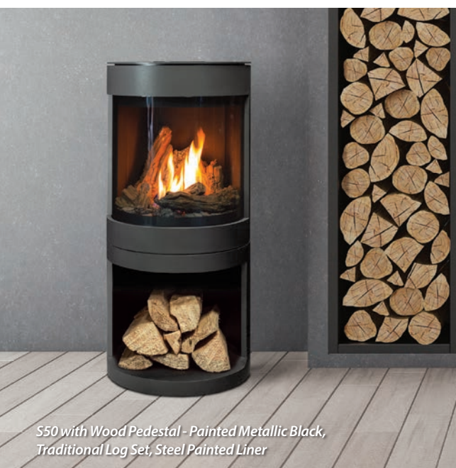
S50 with Wood Pedestal - Painted Metallic Black, Traditional Log Set, Steel Painted Liner