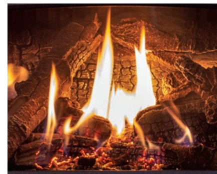
8 Piece ultra high definition log set