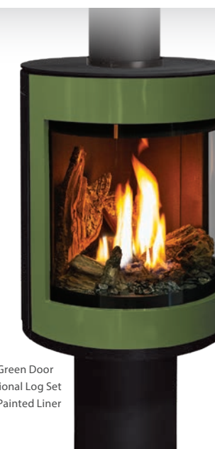
Sage Green Door Traditional Log Set Steel Painted Liner