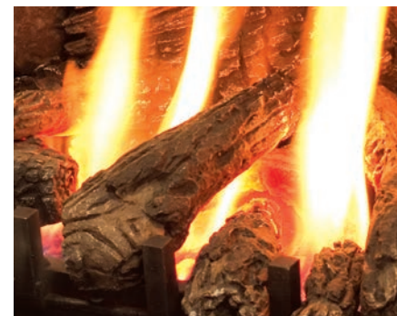
High definition log set