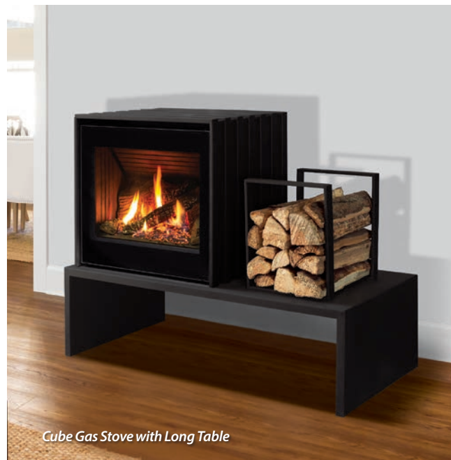
Cube Gas Stove with Long Table