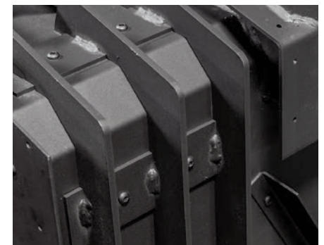
Heavy duty heat exchanger