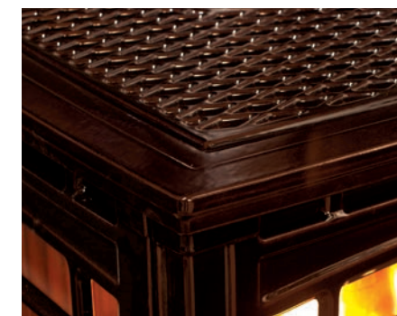
European castings - enameled antique chestnut