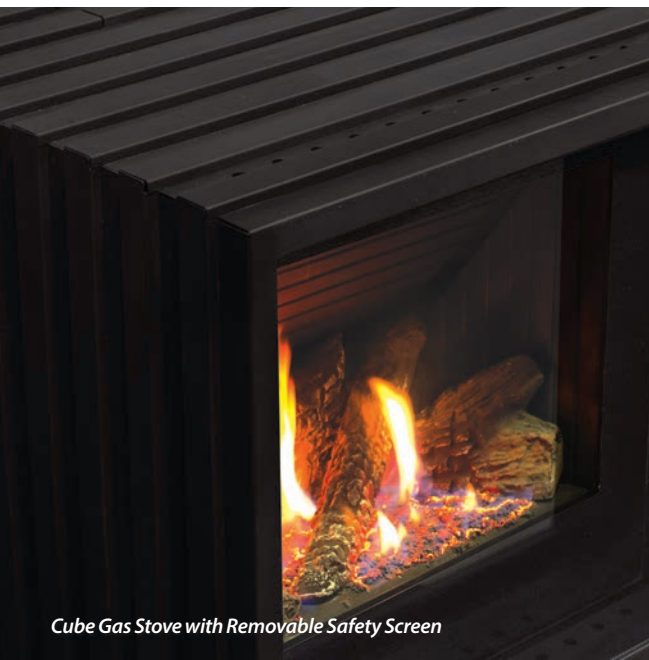
Cube Gas Stove with Removable Safety Screen