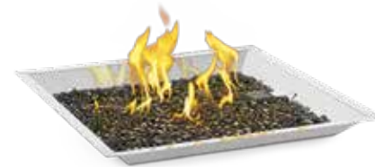
Square Burner Kit - GPFS60