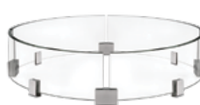
Windscreen Round | GPFCE-WNDSCRN