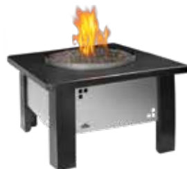
Table and Black Granite Top (optional)