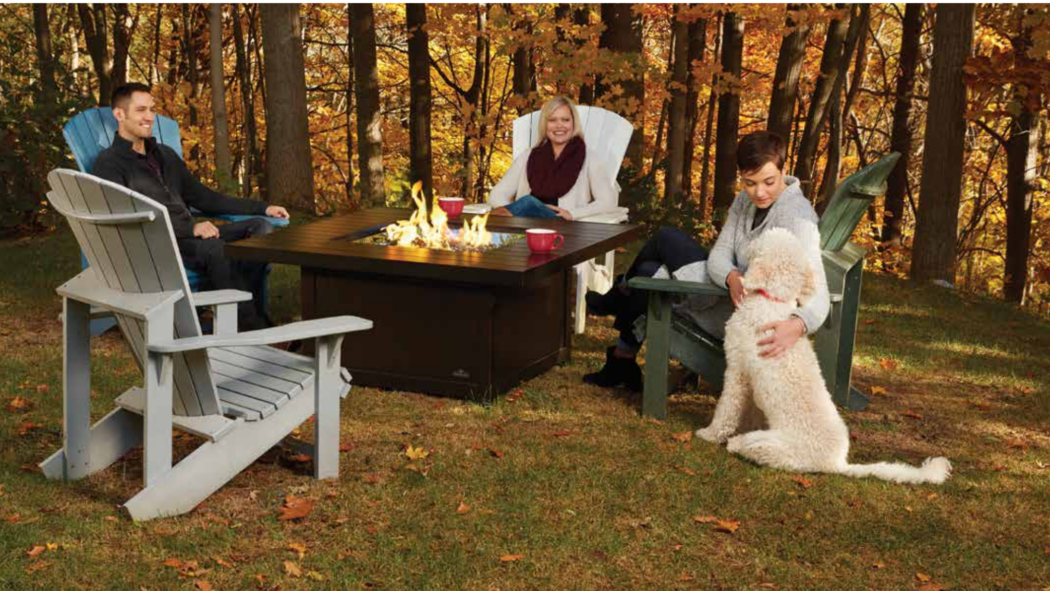
The St. Tropez Square Patioflame® Table