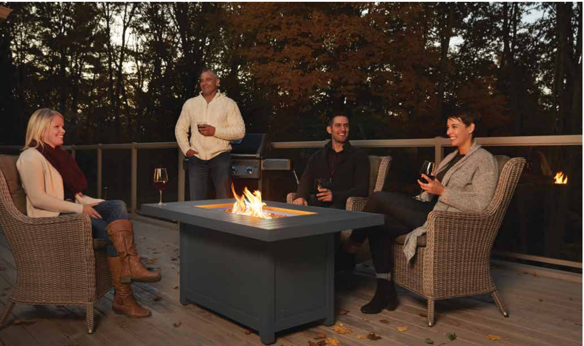
The Hamptons Rectangle Patioflame® Table