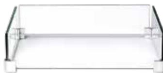
Windscreen Square | GPFTR-WNDSCRN