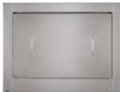
Seasonal Protective Cover (Optional)