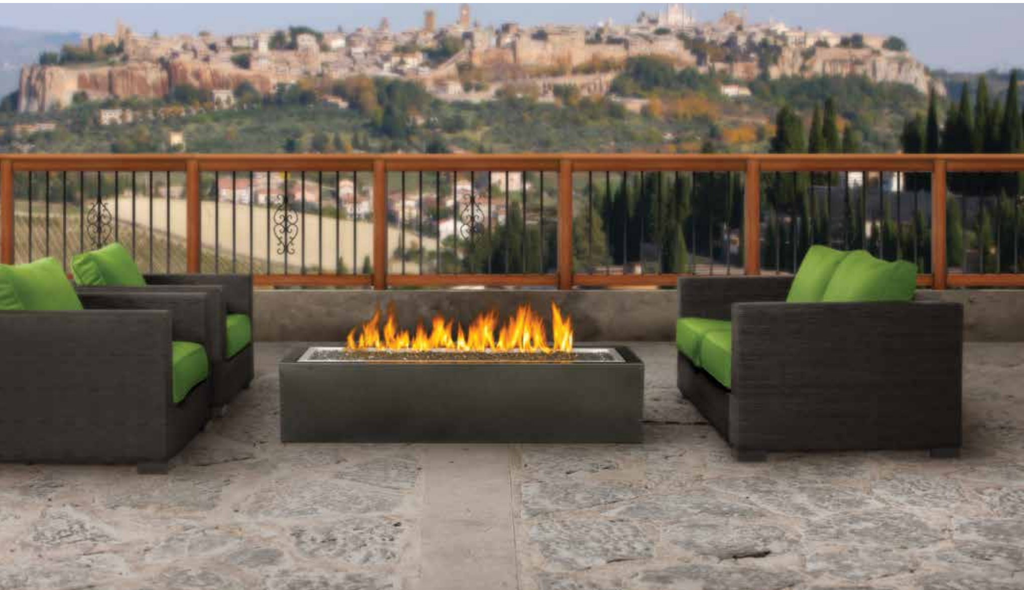
The Linear Patioflame® shown with standard Topaz CRYSTALINE® ember bed