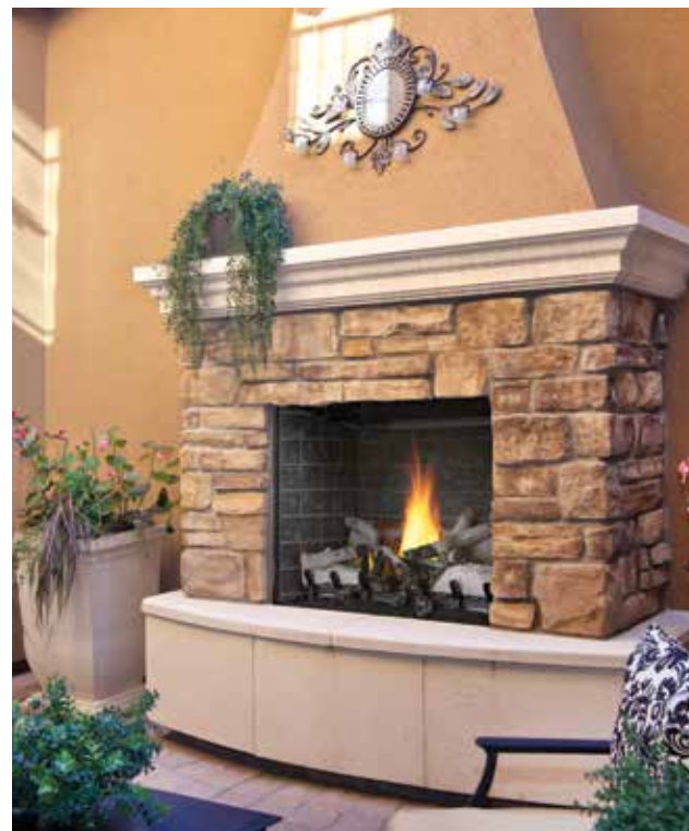
The Riverside™ 36 shown with Westminster Grey decorative brick panels.