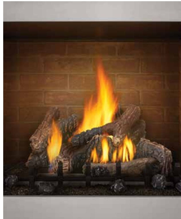
The Riverside™ 42 Clean Face shown with decorative sandstone brick panels