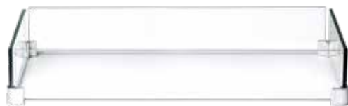
Windscreen Rectangle | GPFTR-WNDSCRN