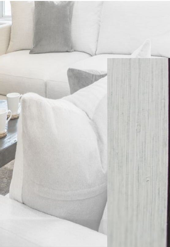
MONTIGO / DELRAY / LINEAR / DRL7213NI-2 / ICE FIREGLASS