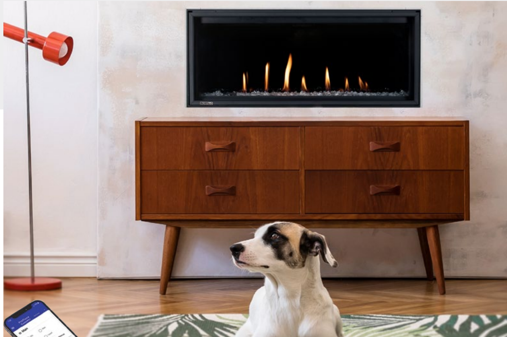
MONTIGO / DELRAY / LINEAR / DRL3613NI-2 / ICE FIREGLASS / REFLECTIVE BLACK GLASS