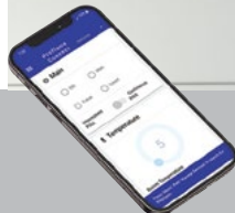
WIFI PHONE APP CONTROL † SIT-WIFI