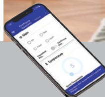
WIFI PHONE APP CONTROL † SIT-WIFI