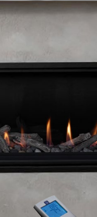
MONTIGO / DELRAY / LINEAR / DRL4813NI-2 / DRIFTWOOD SPECKLED STONES