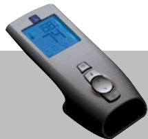
REMOTE †† RX200 **

† Standard for full load units †† Full load units only