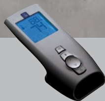
REMOTE †† RX200**