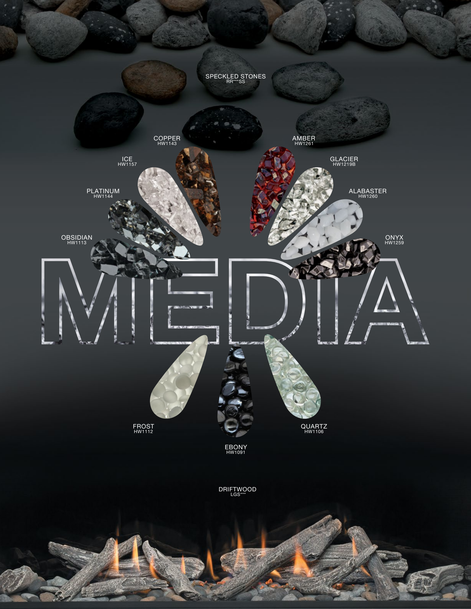
SPECKLED STONES RR***SS