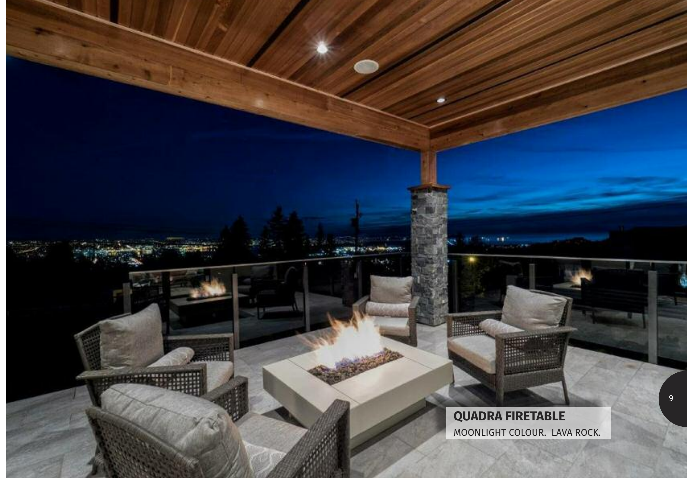
QUADRA FIRETABLE MOONLIGHT COLOUR. LAVA ROCK.