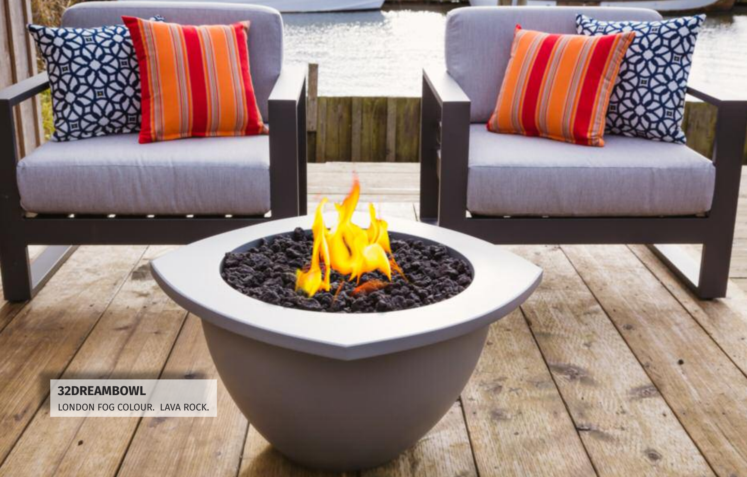
32DREAMBOWL LONDON FOG COLOUR. LAVA ROCK.