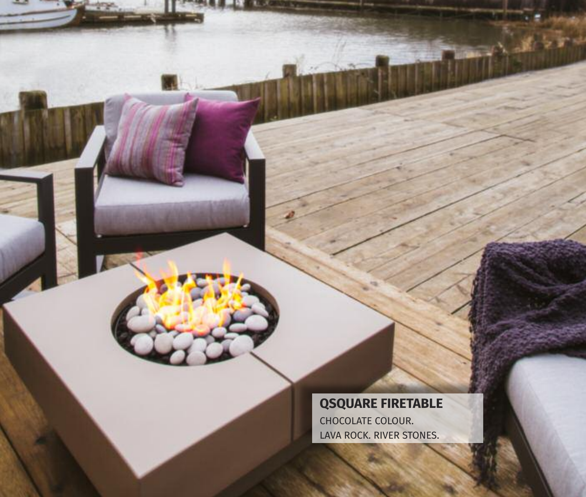
QSQUARE FIRETABLE CHOCOLATE COLOUR. LAVA ROCK. RIVER STONES.