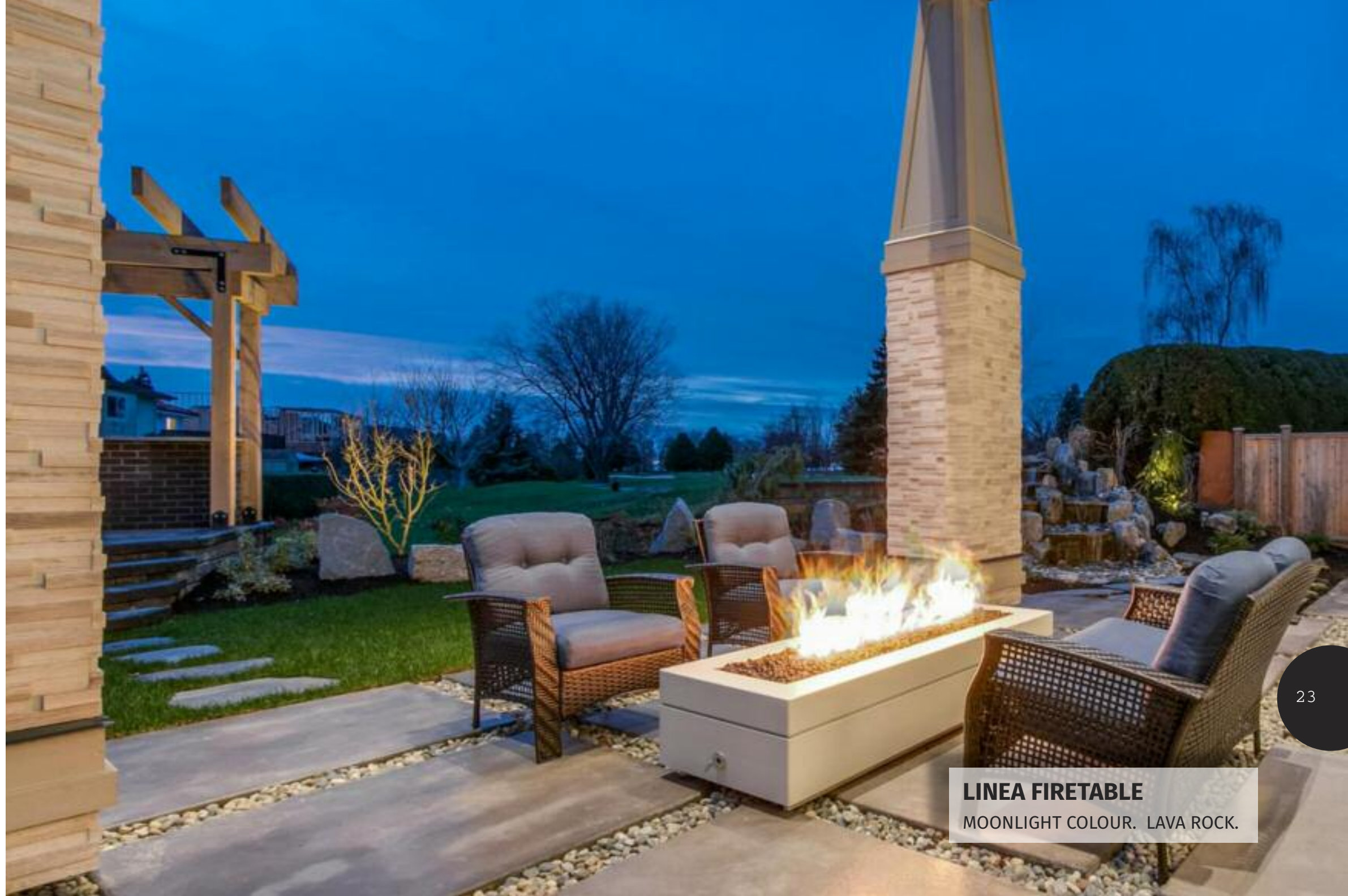
LINEA FIRETABLE MOONLIGHT COLOUR. LAVA ROCK.