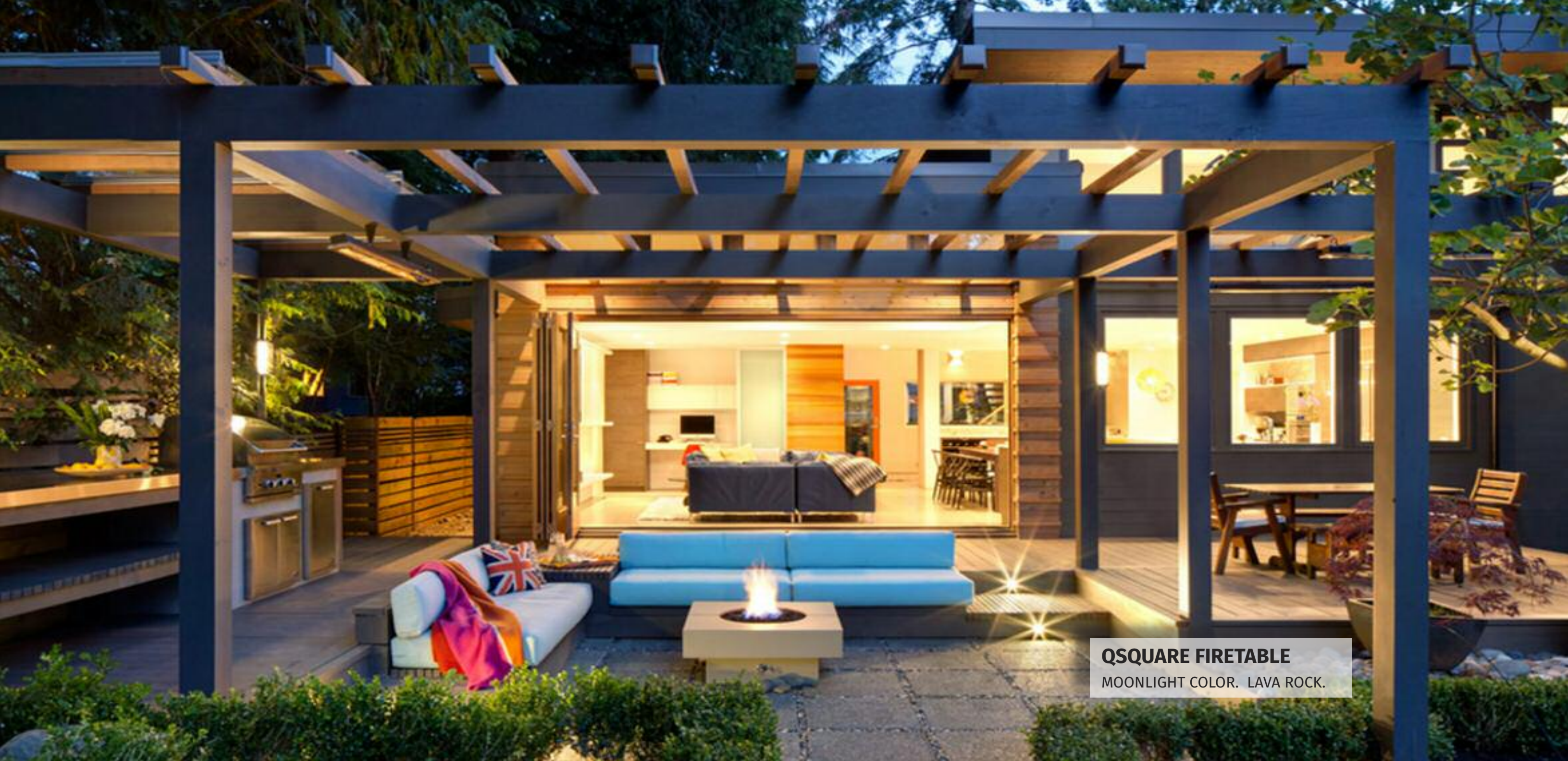
QSQUARE FIRETABLE MOONLIGHT COLOR. LAVA ROCK.