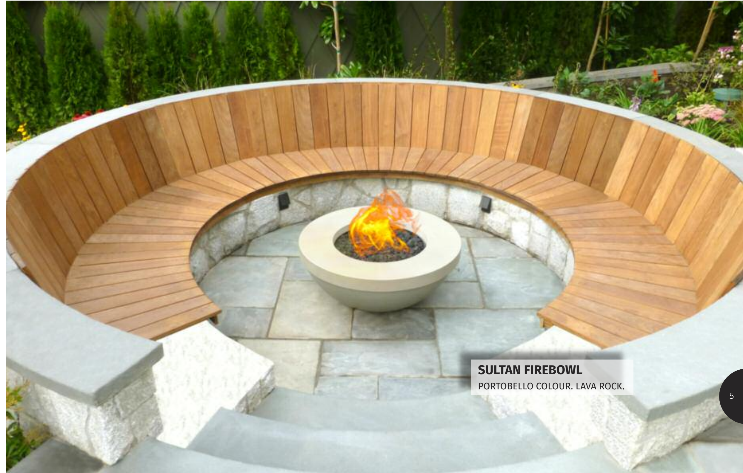
SULTAN FIREBOWL PORTOBELLO COLOUR. LAVA ROCK.