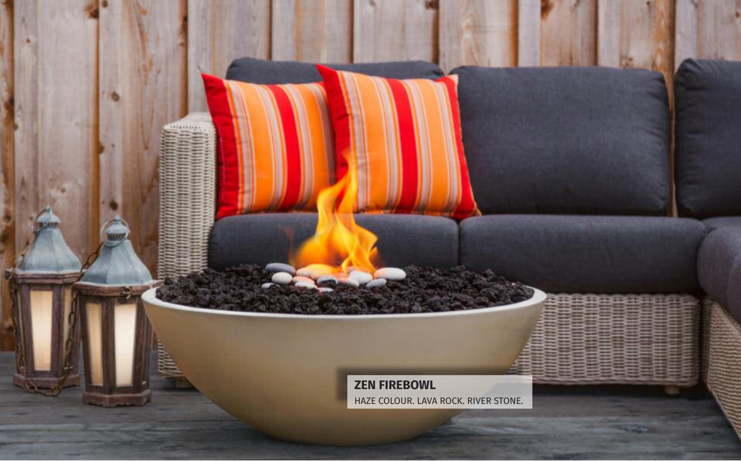
ZEN FIREBOWL HAZE COLOUR. LAVA ROCK. RIVER STONE.