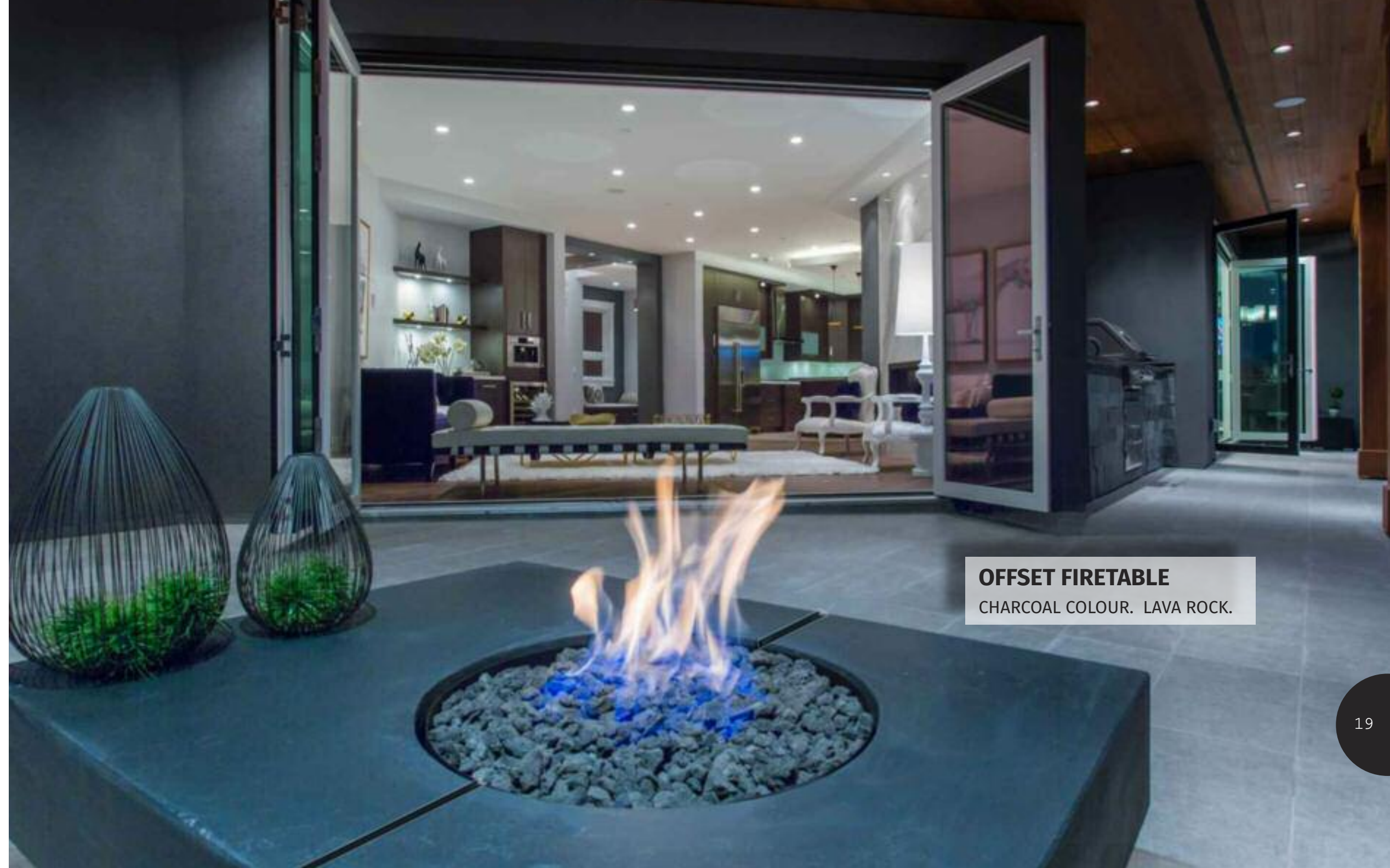
OFFSET FIRETABLE CHARCOAL COLOUR. LAVA ROCK.