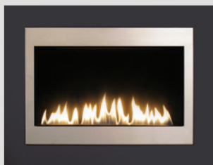
Brushed Nickel Door with Black Surround