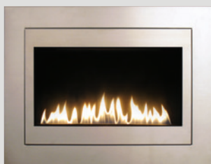
Brushed Nickel Door with Brushed Nickel Surround