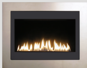
Black Door with Brushed Nickel Surround