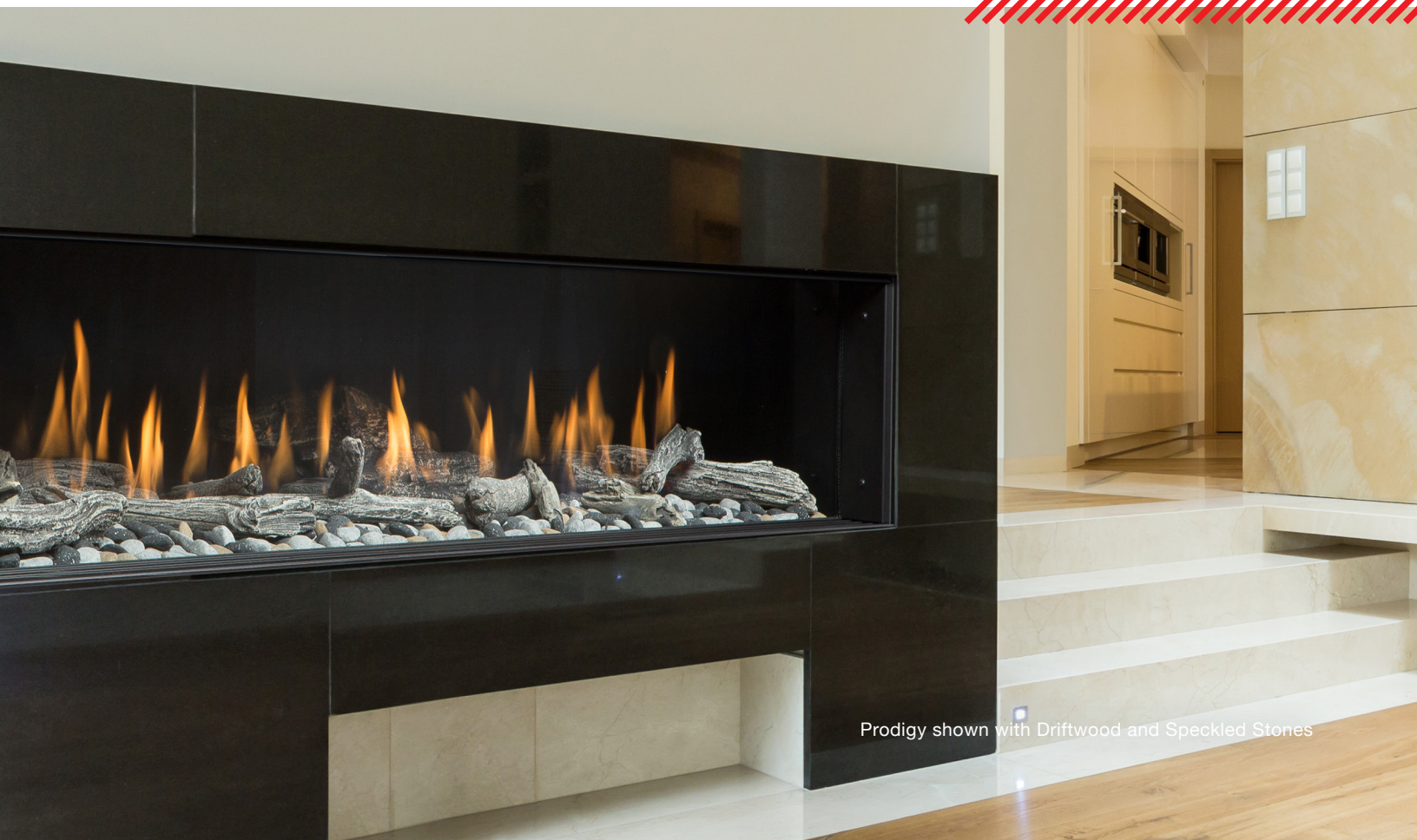
Prodigy shown with Driftwood and Speckled Stones