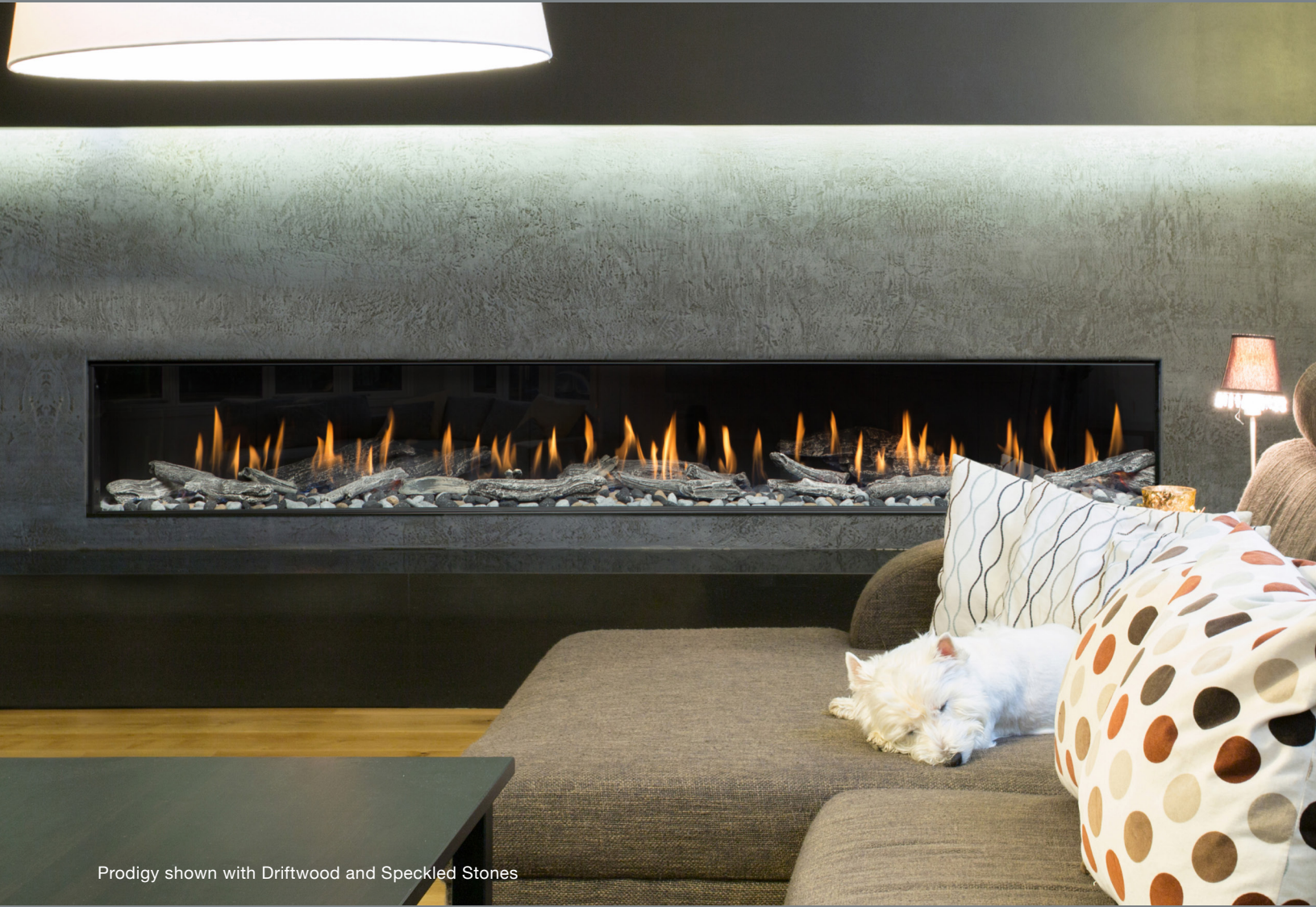
Prodigy shown with Driftwood and Speckled Stones