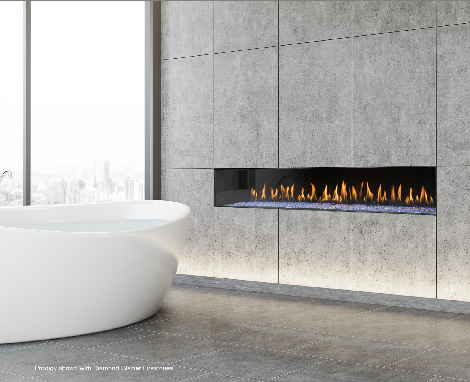
Prodigy shown with Diamond Glazier Firestones

Consult the owner's manual for complete installation instructions, product dimensions and proper clearances to combustible surfaces prior to installing fireplace. All specifications, framing dimensions, product designs, materials and colors are subject to change without notice. The actual flame pattern and color may vary slightly from the illustrations. Diagrams and illustrations are not to scale. Options & accessories may have associated surcharge.