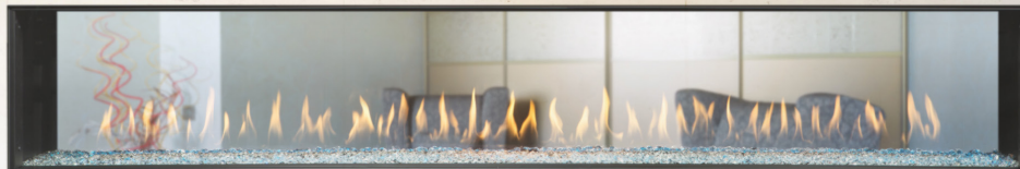
See-Through Prodigy shown with Diamond Glazier Firestones