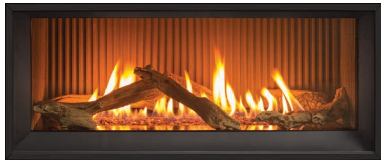
Fluted Liner – Ultra High Definition Log Set