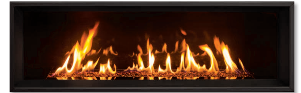
Black Porcelain Liner – Bezel Base