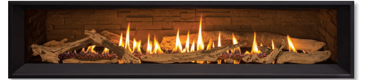
Ledgestone – Rock & Log Set