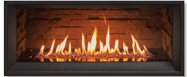
Ledgestone Liner – Bezel Base