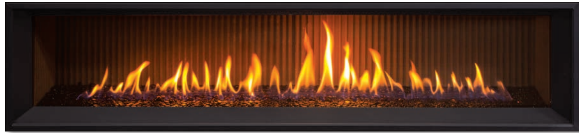
Fluted Liner – Full Glass Tray