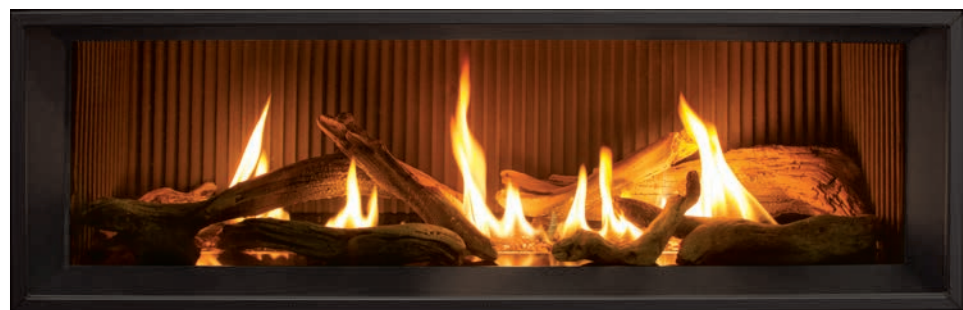
Fluted Liner – Ultra High Definition Log Set