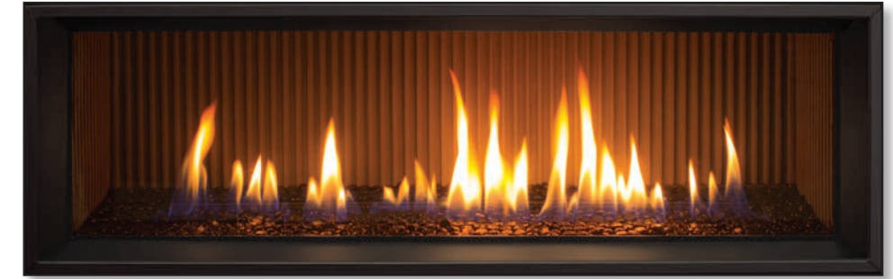
Fluted Liner – Full Glass Tray