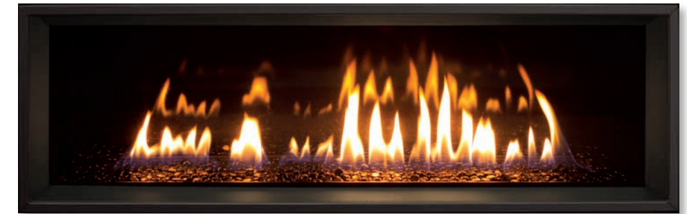
Black Porcelain Liner – Full Glass Tray