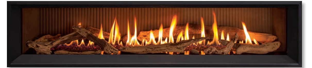
Fluted Liner – Rock & Log Set