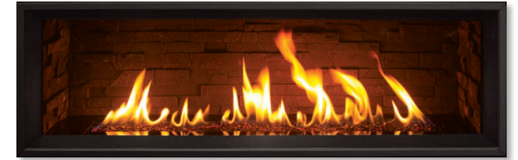
LedgeStone Liner – Bezel Base