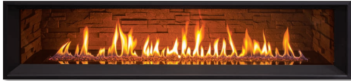
Ledgestone Liner – Bezel Base