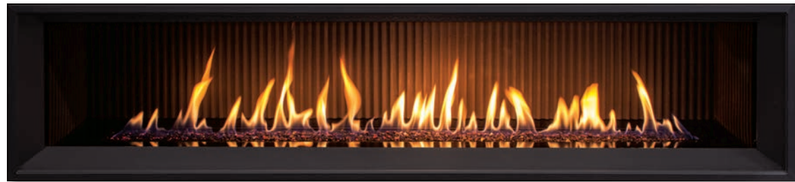
Fluted Liner – Bezel Base