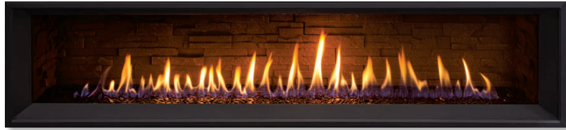
LedgeStone Liner – Full Glass Tray