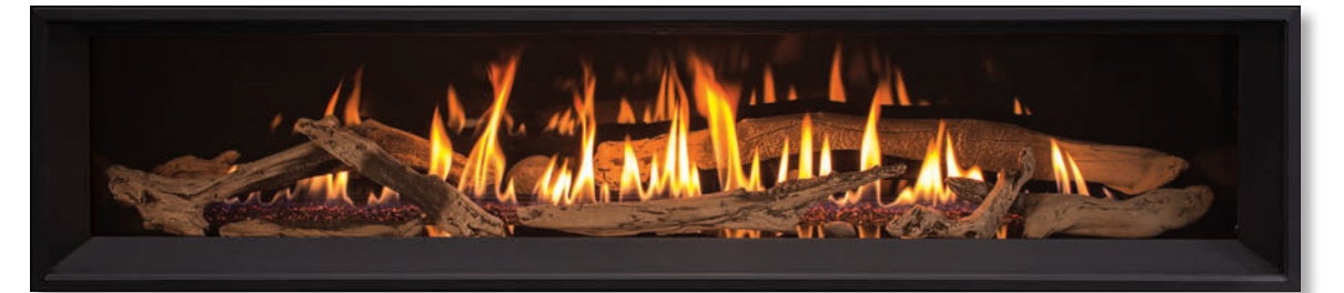
Black Porcelain Liner – Rock & Log Set