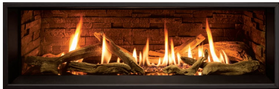
Ledgestone Liner – Ultra High Definition Log Set