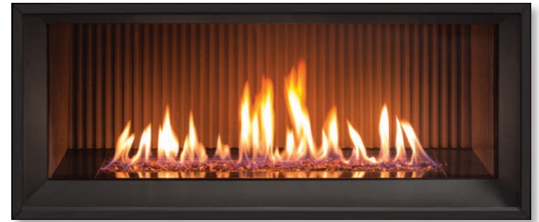
Fluted Liner – Bezel Base