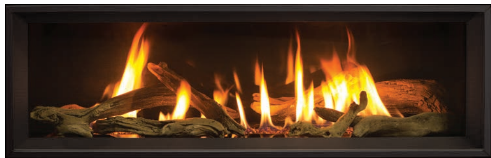
Black Porcelain Liner – Ultra High Definition Log Set