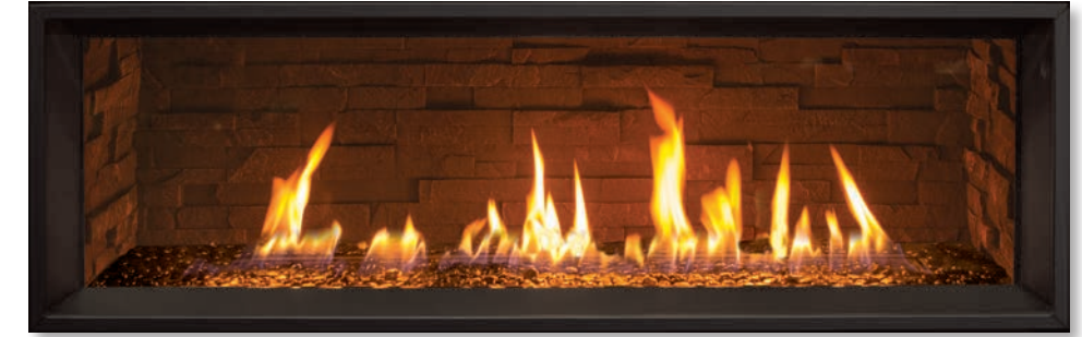
Ledgestone Liner – Full Glass Tray