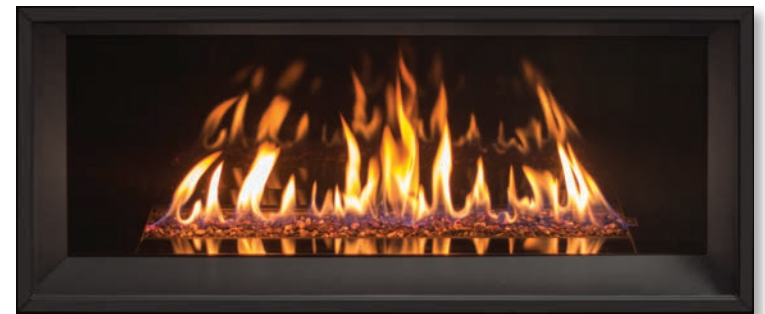
Black Porcelain Liner – Bezel Base