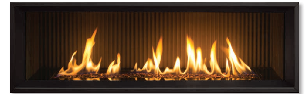
Fluted Liner – Bezel Base