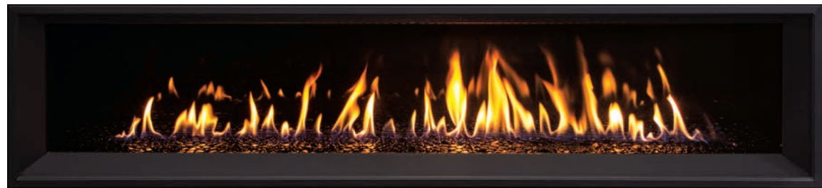
Black Porcelain Liner – Full Glass Tray