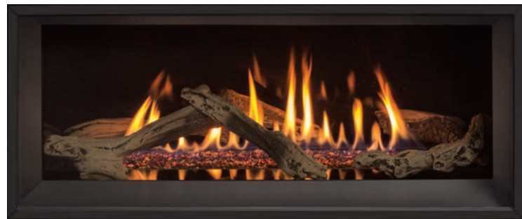
Black Porcelain Liner – Ultra High Definition Log Set