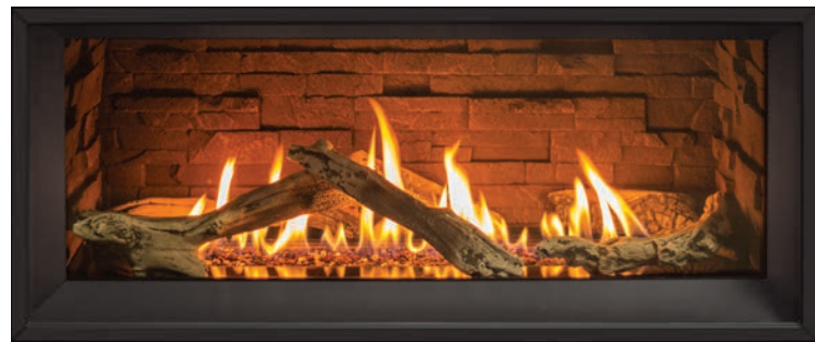
Ledgestone Liner – Ultra High Definition Log Set