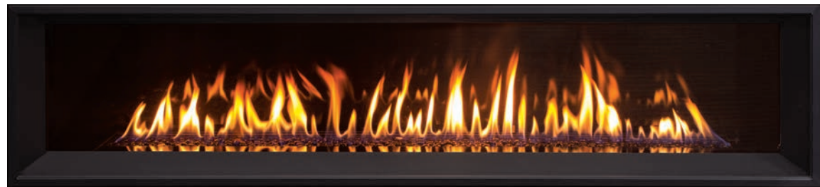
Black Porcelain Liner – Bezel Base