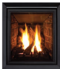
4-SIDED MINIMAL SURROUND