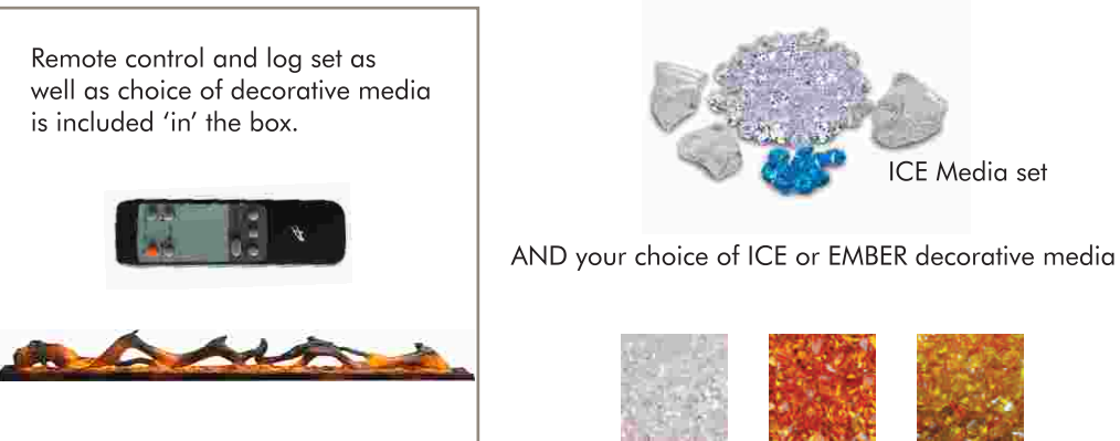
*Remote control may not be exactly as shown

In the box for WALL MOUNT / FLUSH MOUNT MODELS