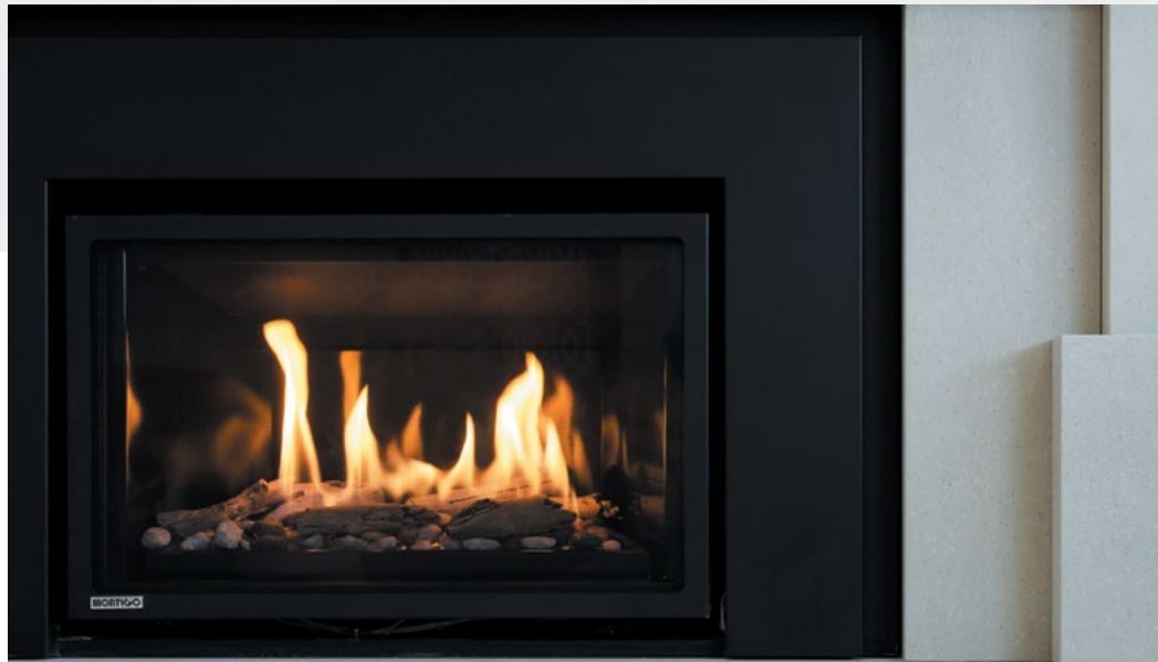
MONTIGO / ILLUME / 30FID / CONTEMPORARY