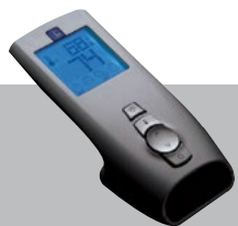
REMOTE Δ RXM5010