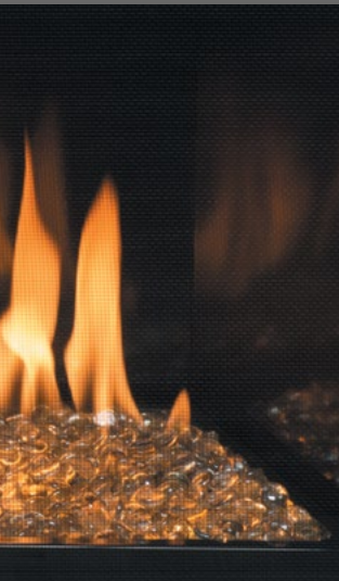
MONTIGO / ILLUME / 34FID / CONTEMPORARY