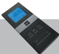
WALL REMOTE REC1493