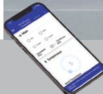
WIFI PHONE APP CONTROL SIT-WIFI