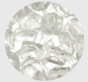
MQG5W White Ember Glass