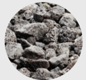
MLR1410 Lava Rock