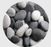
MQSTONE Decorative Stone