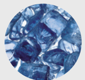
MQG5A Cobalt Ember Glass