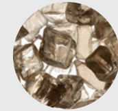
MQG5C Bronze Ember Glass