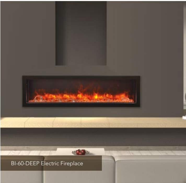
BI-60-DEEP Electric Fireplace