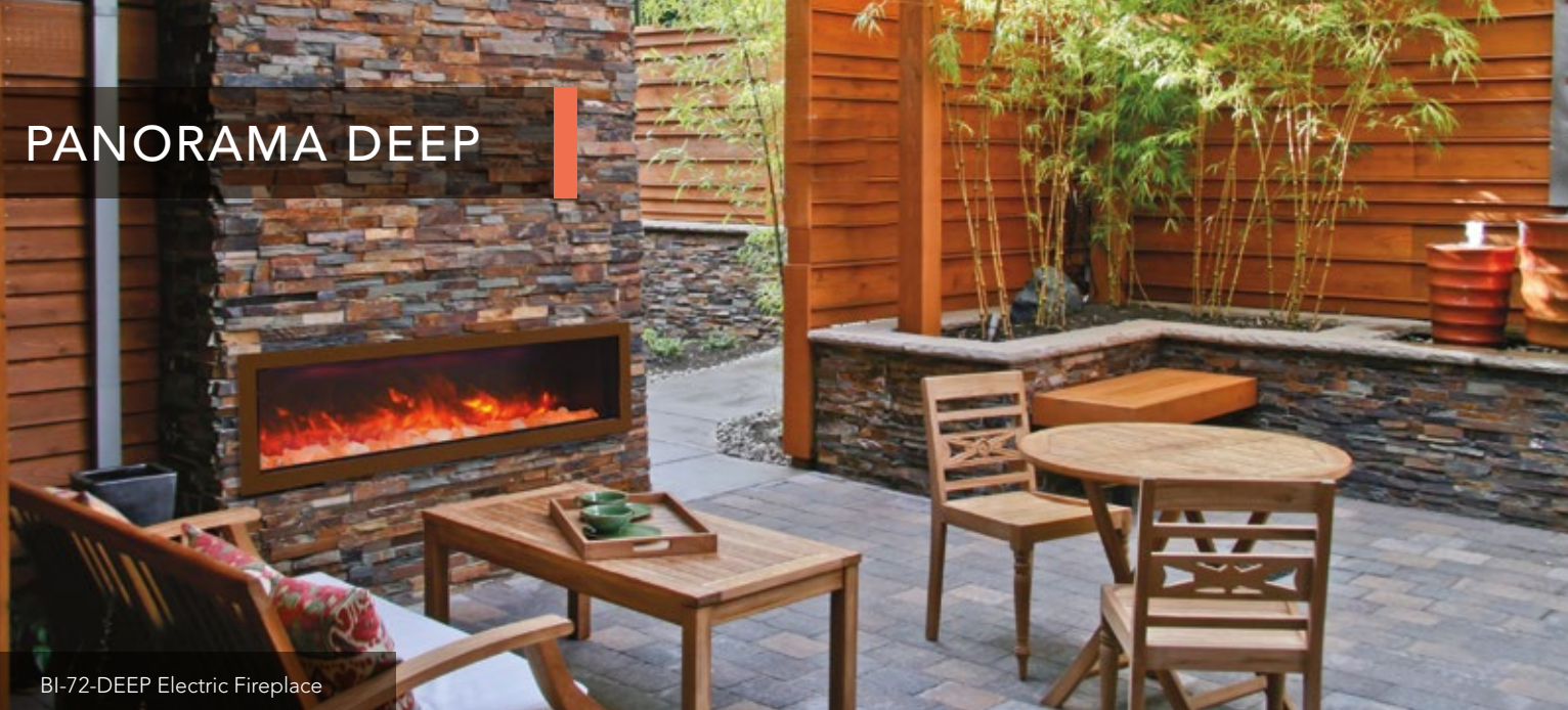
BI-72-DEEP Electric Fireplace