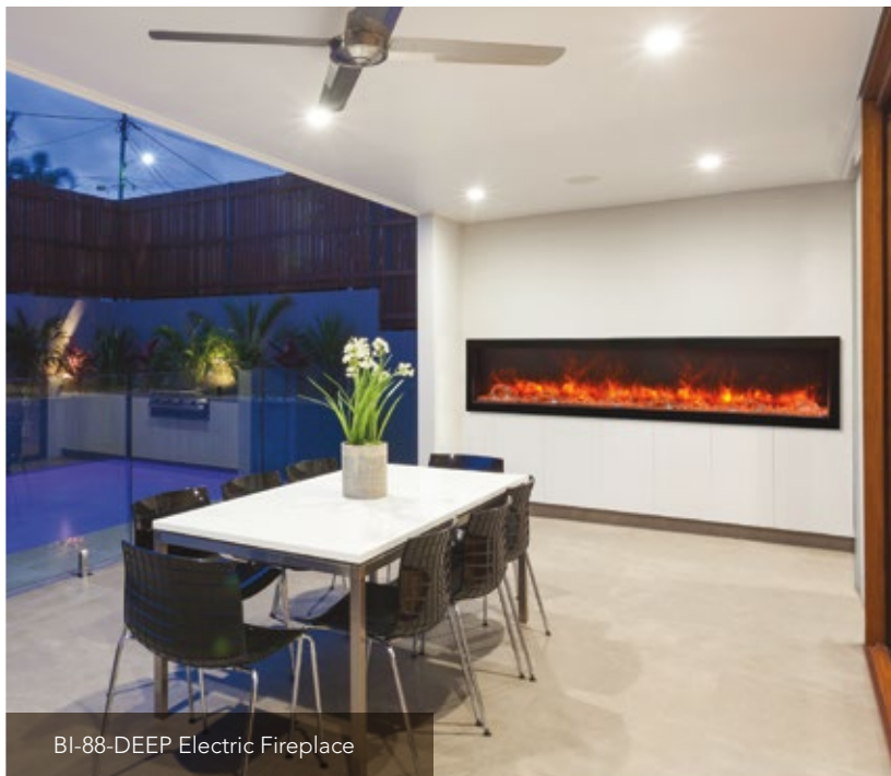
BI-88-DEEP Electric Fireplace