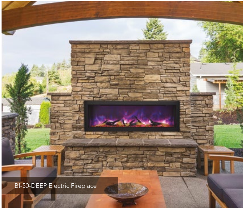
BI-50-DEEP Electric Fireplace