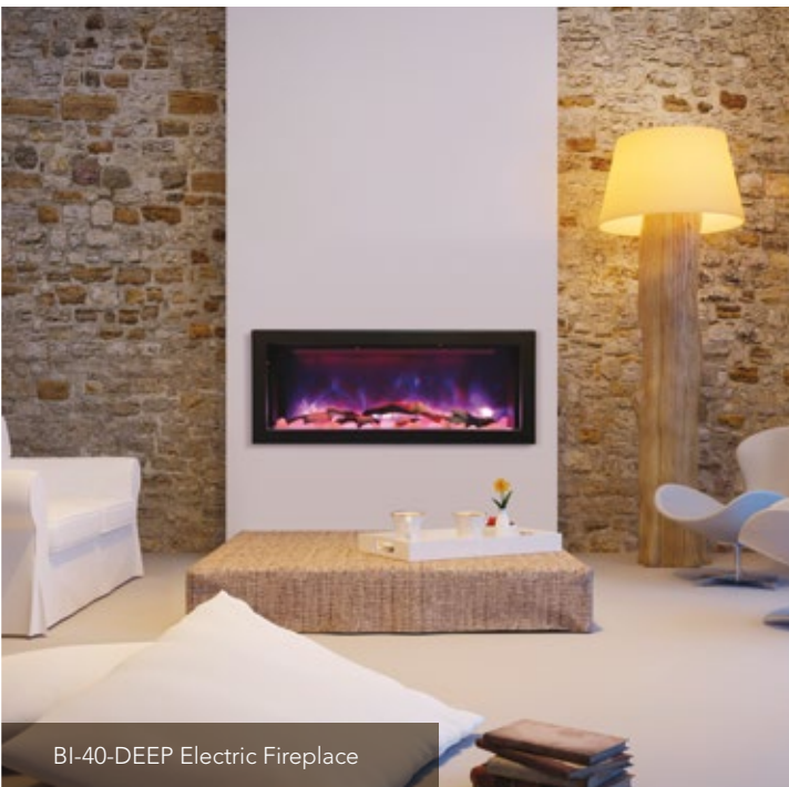
BI-40-DEEP Electric Fireplace